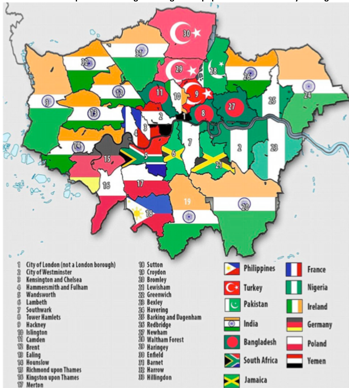
SOURCE C: This map shows the largest foreign born populations in London by borough